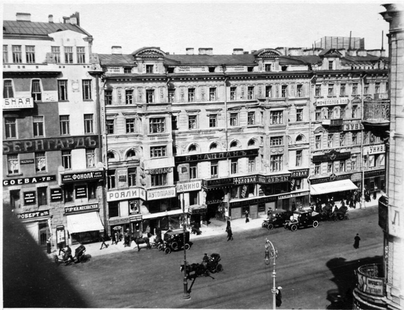
Figure 6. Boris Kaplan's store sign, 74 Nevsky Avenue, Saint Petersburg, before 1914.

One can see the united apartments 7 and 8 on the third-floor plan (TsGIA SPB 515/4/3914, 22). This joined apartment occupied the whole floor in that part of the building facing Nevsky Avenue, the main street of the city. The third floor is the one with the highest ceilings (TsGIA 513/102/4319, 37). Thus, one can assume that this accommodation was the most luxurious in the house. A tailor's business constituted part of it. One can see a large sign for Boris Kaplan's shop above the third-floor windows along the Nevsky Avenue façade of the building in a photo predating 1914 (Figure 6).