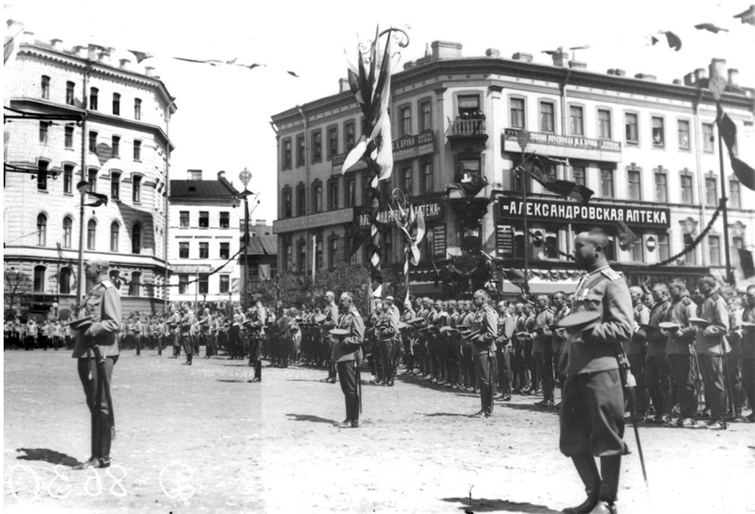
Figure 3. Photo of Alexandrovskaya Pharmacy on Znamenskaya (Vosstaniya) square, Saint Petersburg, 1909 (TsGAKFFD SPB D 8630).